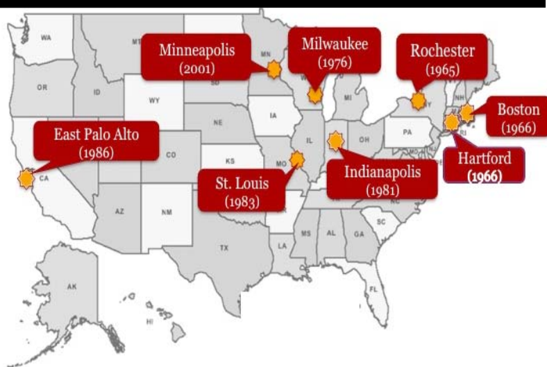
Figure 1: Map of Eight Inter-District School Desegregation Plans and Their Date of Origin

Most of these inter-district desegregation programs have existed for the last 30-40 years. However, this report represents the first effort to tell their stories and pull together the research and history that provide lessons that inform policy and practice. Given their use of ever-popular school choice options to address achievement gaps between students of different racial and ethnic groups, these programs clearly offer some of the most hopeful models for the future of U.S. education policy. Unfortunately, these programs are currently politically and legally fragile because of efforts to end race-conscious policies. Yet if policymakers are sincere about their desires to offer meaningful school choices and close racial/ethnic gaps in student outcomes, they need to carefully examine these eight programs, which have to a larger extent quietly accomplished both goals.