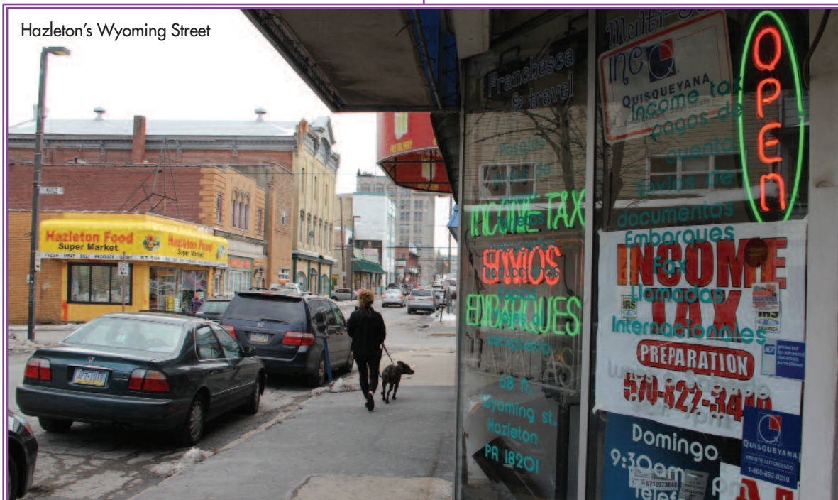
Hazleton’s Wyoming Street

On an old overpass, a spray-painted (and misspelled) slur, Spick, is fading. Not long from now, it will barely be visible. Signs of progress along Hazleton’s Wyoming Street, downtown, feel more enduring.