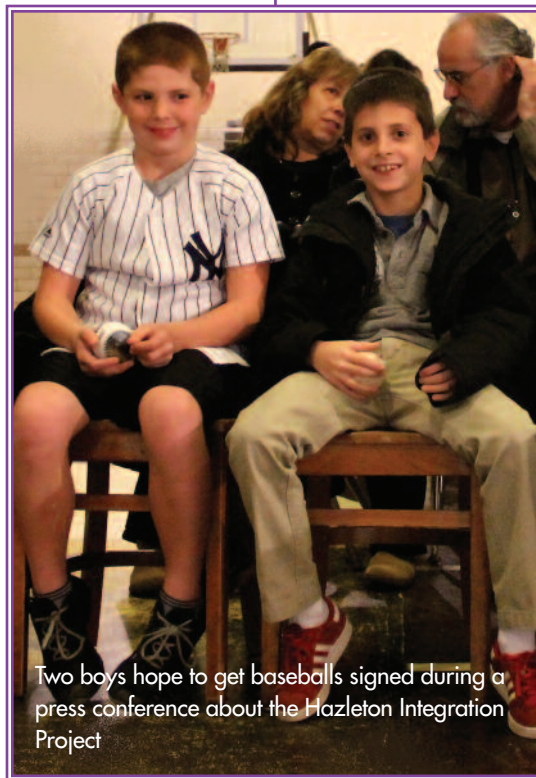
Two boys hope to get baseballs signed during a press conference about the Hazleton Integration Project