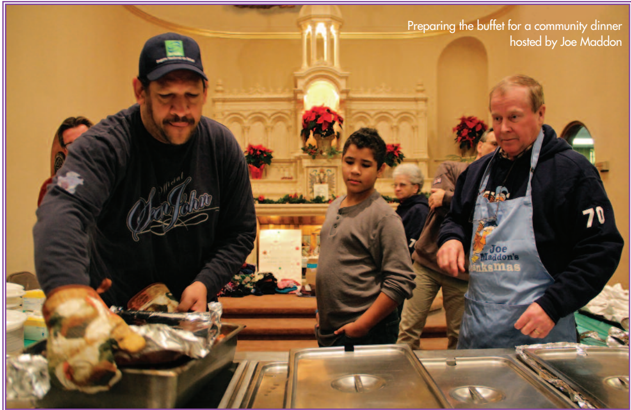
Preparing the buffet for a community dinner hosted by Joe Maddon

mountain biking and fine wines. Back in the late 1970s and early 1980s, he learned his nearly fluent Spanish from his friend, the Puerto Rican shortstop Dickie Thon, when they were both with the California/ Anaheim Angels organization. (Maddon had been a bench coach for the Angels and interim manager there in 1996 and 1999.)